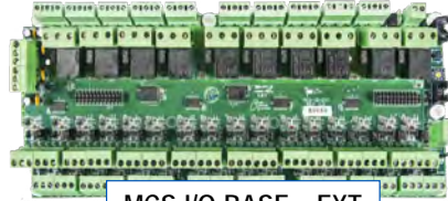
MCS-I/O-BASE + EXT

MCS-MAGNUM-N-12 12VDC Powered by optional Single Output Power Supply 85-264VAC input 12VDC output regulated