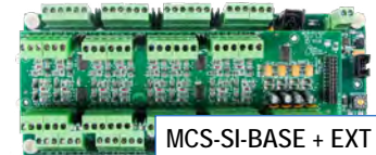
MCS-SI-BASE + EXT