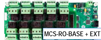
MCS-RO-BASE + EXT